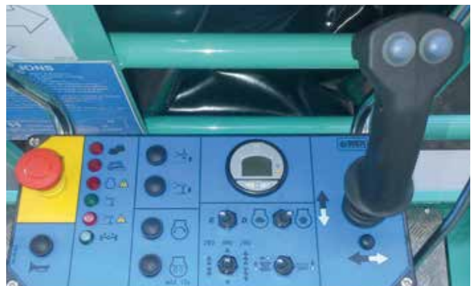
Sturdy, simple and intuitive control box on platform