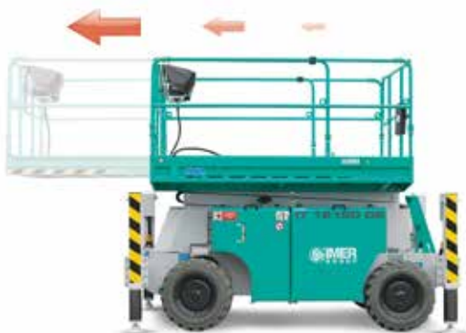
Manual deck extension 1.4 m